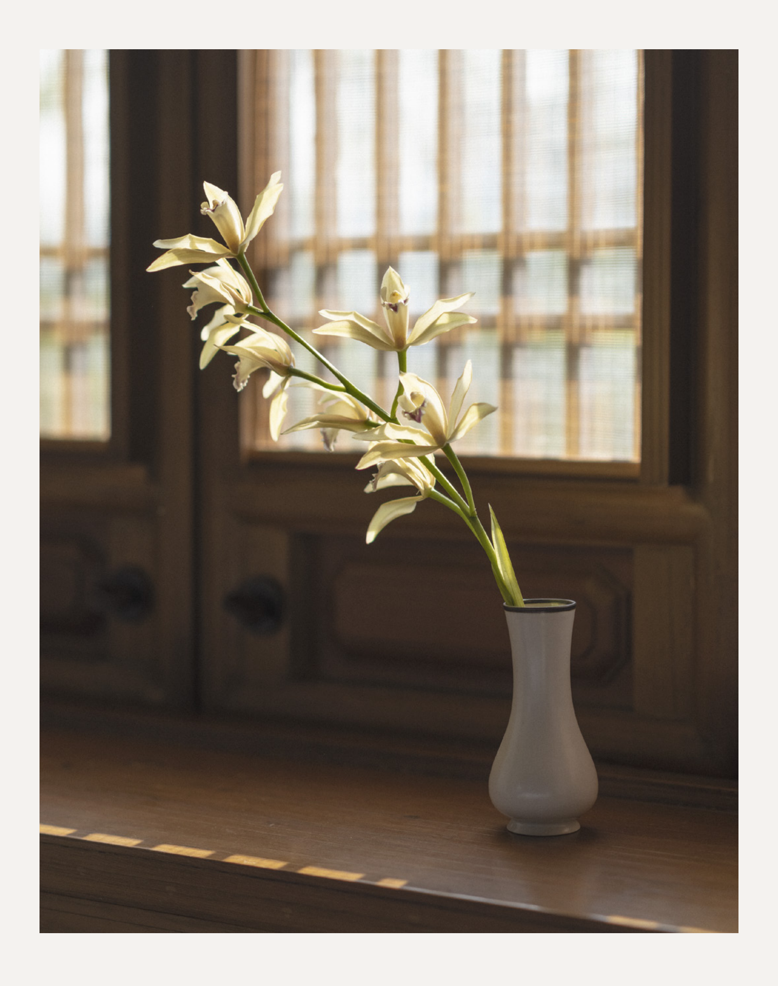
AMANDAYAN 29 Shishan Road, Gucheng District, Lijiang Yunnan, 674199, China

Tel: +86 888 533 9999 Email: amandayan.res@aman.com